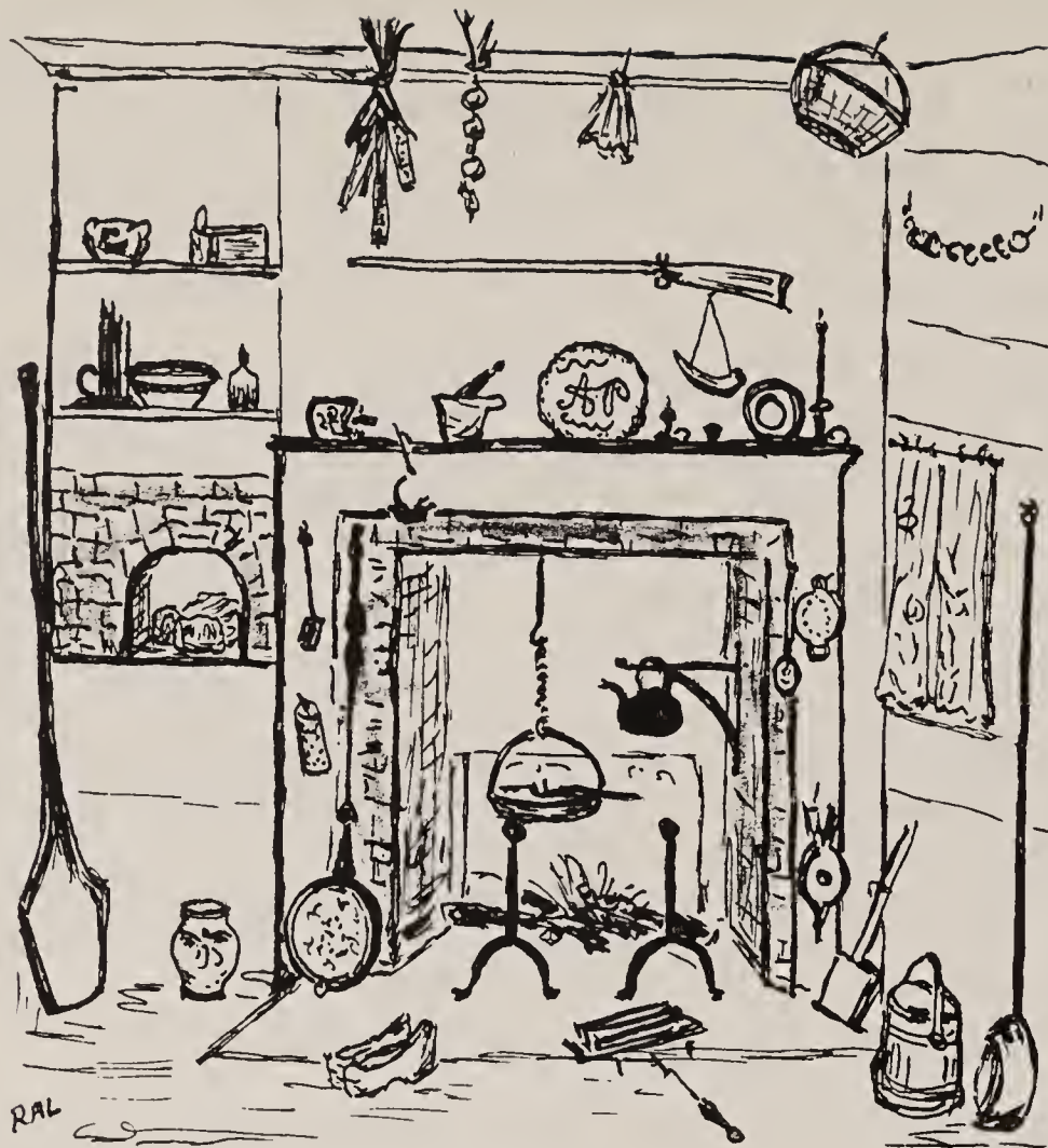
Dutch Kitchen Paramus Historical and Preservation Society 650 East Glen Avenue Ridgewood, New Jersey